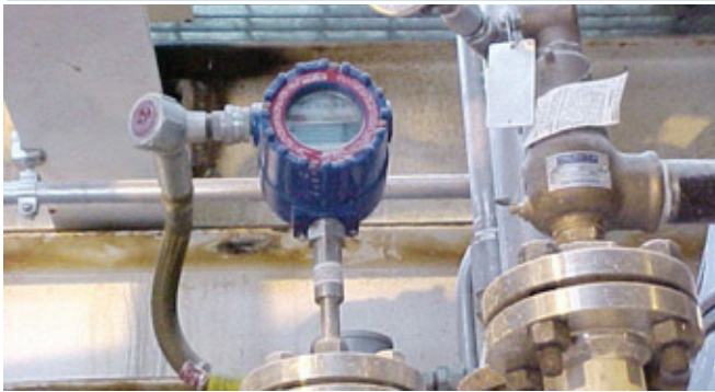
MTS Level Plus Model MR Analog Transmitter with Optional Single-Cavity Explosion-Proof Housing