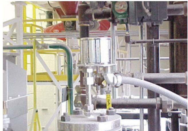
MTS Level Plus Model MR Transmitter with NEMA Type 4X Enclosure

The MTS level transmitter above with the NEMA type 4X 316L stainless-steel enclosure option. This level transmitter is mounted in a recovery tank for water monitoring level using one float and is in a Kosher process.