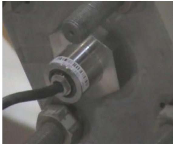
R-Series Model RD4 Sensor rod installed in cylinder end cap with minimal available clearance.

Save time and energy by replacing your sensors with the brand that has been proven to work. Why replace your sensor with anything but Temposonics technology? MTS Sensors provides the knowledge and support you need to get up and running quickly. Over the years, MTS Sensors has developed numerous custom solutions for flight simulators using Models GH and RH hydraulic style sensors. Now with the flexibility of the Model RD4 sensor for tight spaces, a solution exists for most any application. Contact our application engineering technical support line at 1-800-633-7609 for more details.