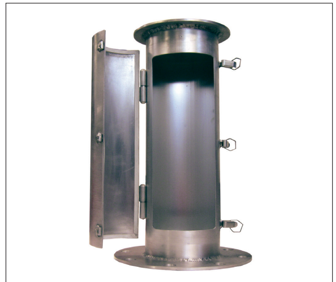
Fig. 4: Spool piece with open door

Temposonics has a better solution. Install the Tank Slayer® transmitter and a spool piece (as shown in 'Figure 4') mounted on top of your stilling well. Unlike other level transmitters, the Tank Slayer® does not have to be removed or taken out of service during manual gauging, sampling or installation.