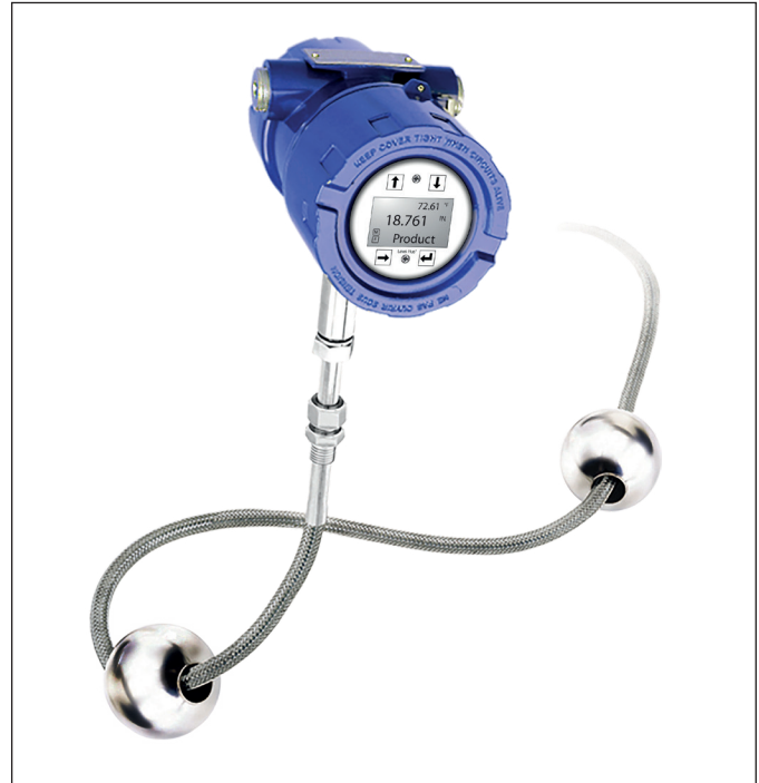
Fig. 2: Tank Slayer® transmitter